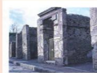
The front of Caecilius' house. The spaces on either side of the door were shops he probably owned.